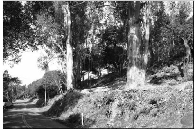
Atlas Peak roadside AFTER vegetation clearing