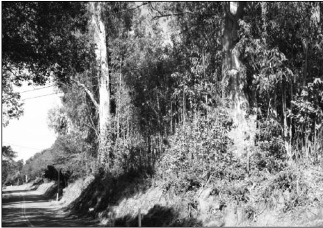
Atlas Peak roadside BEFORE vegetation clearing